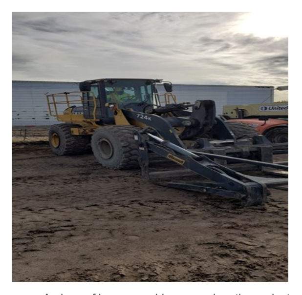
A piece of heavy machinery used on the project