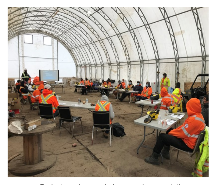
Project employees during a work presentation